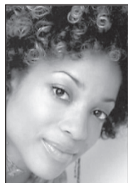
Tamyra Gray Appeared in "Bombay Dreams"

Ads with her name splashed in large, bold type popped up all over New York City. A mad scramble for tickets erupted. Fans squealed the moment she stepped on stage. Crowds mobbed her at the stage door, clamoring for autographs and pictures. And producers of the show rejoiced in their financial good fortune.